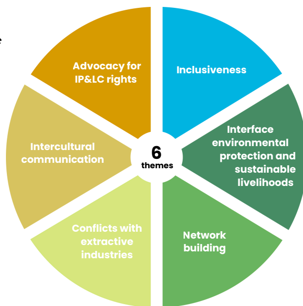
figure 1: themes discussed in online sessions

“Genuinely respect and trust the decisions of the IP&LCs, they know what is best for them, based on their own aspirations’ CSO from PH