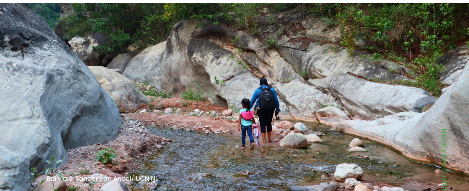
Bolivia