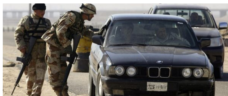
Checkpoint near Rumaila oil field.