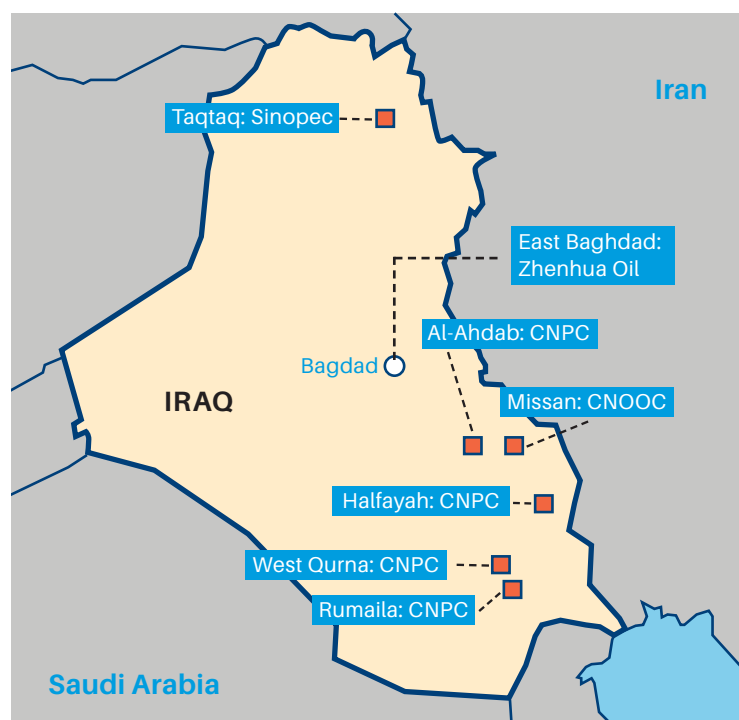
Chinese oil companies and oil fields in Iraq

China National Petroleum Corporation (CNPC) is one of the international oil companies operating in Iraq after the war and in difficult circumstances. The company has contributed significantly to the country joining the Extractive Industries Transparency Initiative (EITI) by participating in the Multi-Stakeholder Groups (MSG) of EITI.