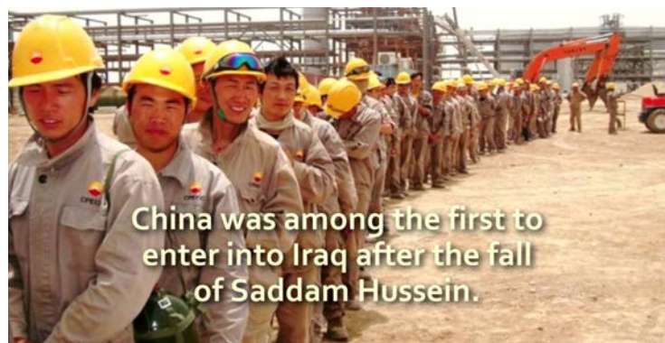
Chinese oil workers in Iraq

2016, several projects with an annual investment of 1 million US dollars were under construction in Iraq. CNPC participated actively in the improvement of reporting guidelines for the oil sector in the framework of Iraq's EITI and ensured the inclusion of detailed information about oil production from the Al-Ahdab oilfield, in which the company holds a 50% interest. This was despite the company being exempt from EITI reporting requirements as its activities were in early stages of production and the company was not yet making material payments to the government of Iraq.